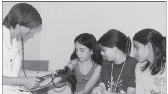
The 9 AMAA CE soccer teams that participated in this year's soccer tournaments (above). Children getting medical exams in preparation for summer camps.

Many of Armenia's children are in need. A recent study by two child welfare special-