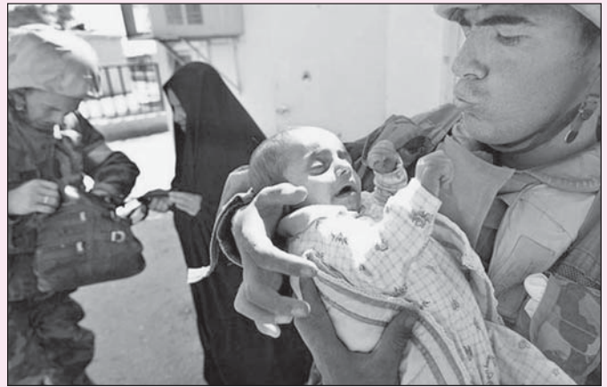
A U.S. Marine with the 15th Expeditionary Unit holds a baby as the baby's mother attempts to pass through a checkpoint at a Hospital in AnNasiriyah, Iraq.

The AMAA is the missionary arm of the Armenian Evangelical Churches worldwide, and its relief efforts are primarily directed to Armenian Communities in need of assistance in the homeland and the Diaspora. Nevertheless the AMAA also concerns itself with the needs of victims of natural and man-made disasters around the world. The crisis in the