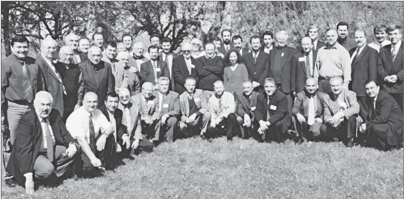
The Participants in the World Council of Armenian Evangelical Pastors in Thollon - Evian, France (Story on page 5)