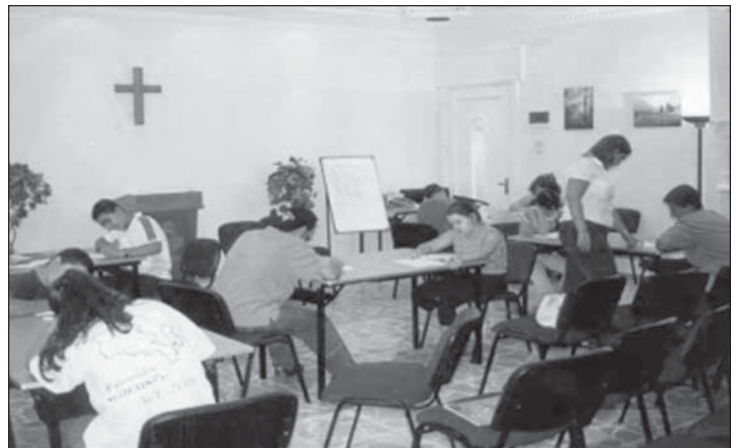
English language course for pre-teens.

We thank God for blessing us with the vision to serve our people in this region of the world. Our aim is to improve our Christian testimony and make it more effective. We ask you to continue to pray for us as we serve our God by obeying and trusting Him. □