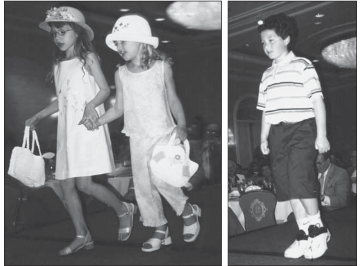
Some of the children modeling for the Fashion show.

The silent Auction raised over $10,000 thanks to Silent Auction chairs,